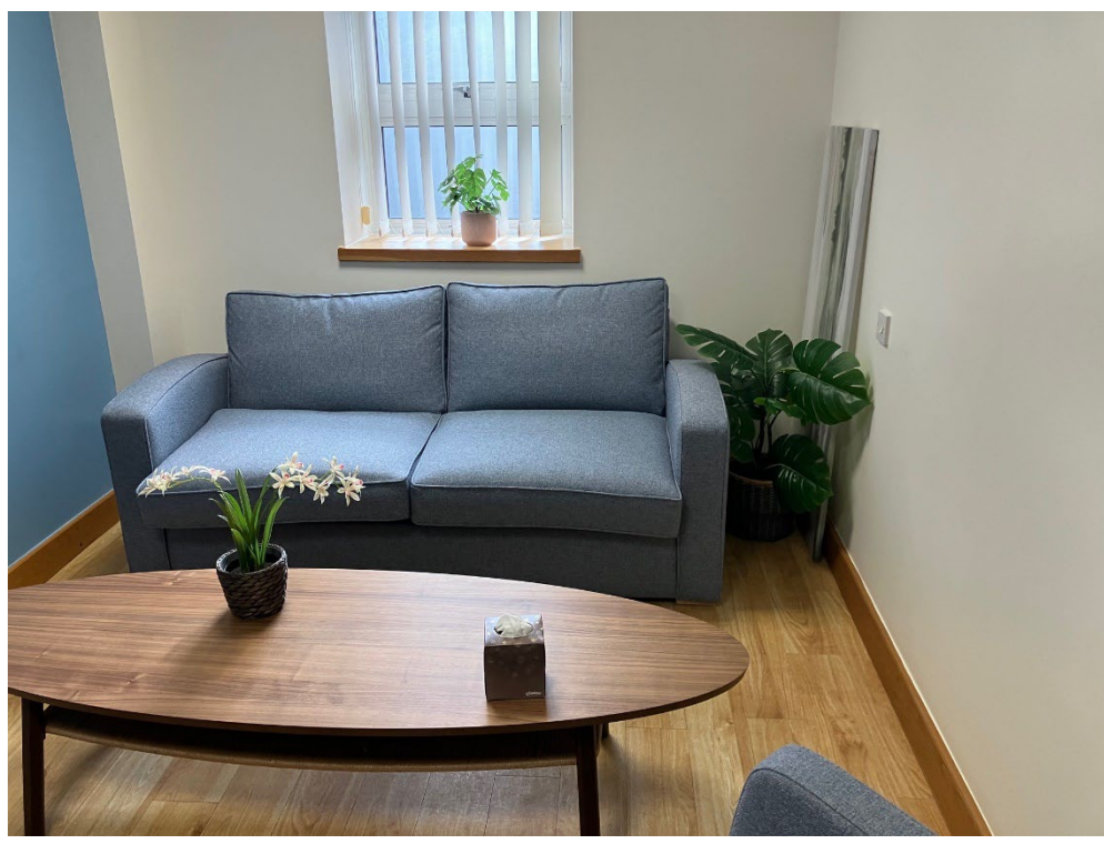
Newly decorated family room.

The family room was well decorated, but the painting and clock were still waiting to be hung.